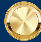
GOLD RECEPTION & LUNCHEON SPONSOR