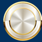
FEATURED OPENING KEYNOTE SPONSOR