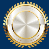
PLATINUM EXCLUSIVE PRESENTING SPONSOR